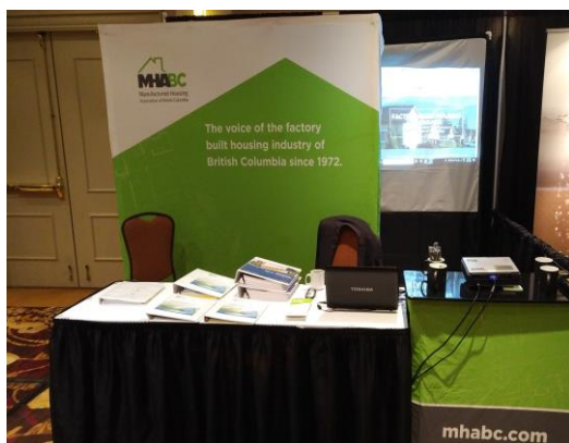
MHABC Booth at the BOABC Conference

Well over 80 building officials visited the booth where they were provided information cards explaining the local government information landing page, resident on MHABC.com. The symposium provided an opportunity to present additional information on the landing page.